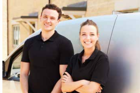
Getting into Self-employment