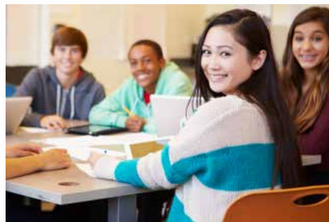
Options at 18