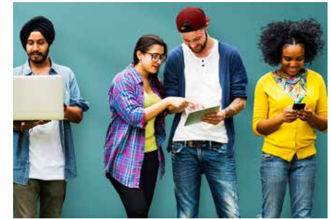
Choosing subjects and courses at 18