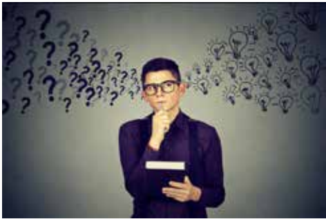
How to choose the right subject or course