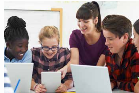
Choosing subjects and courses at 16