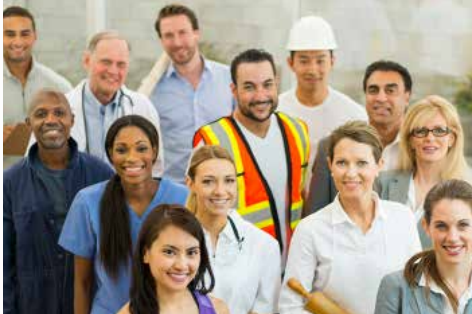
Getting a Job