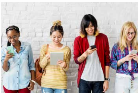
Options at 16