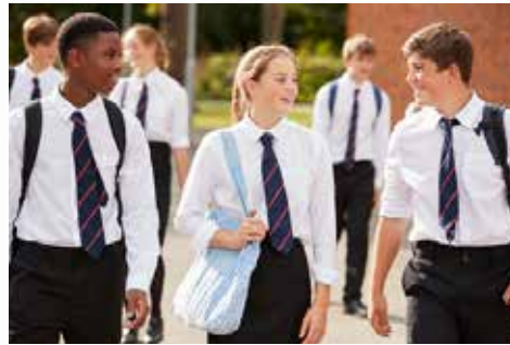
Choosing subjects in Year 8 and 9